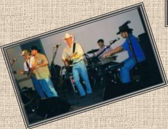
Past Builders Bash