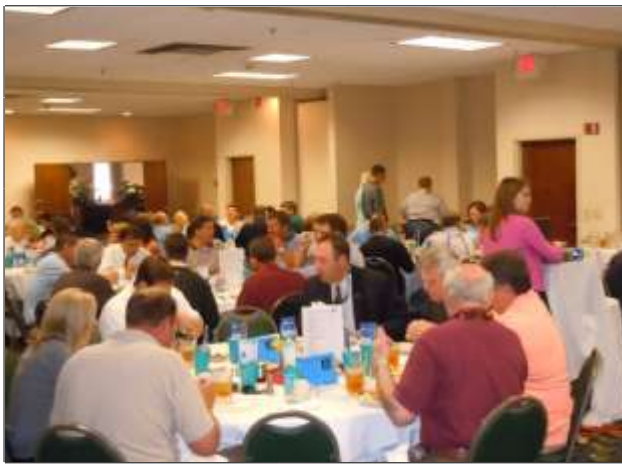
Thank You AAHBA Members & Guests for your Support!