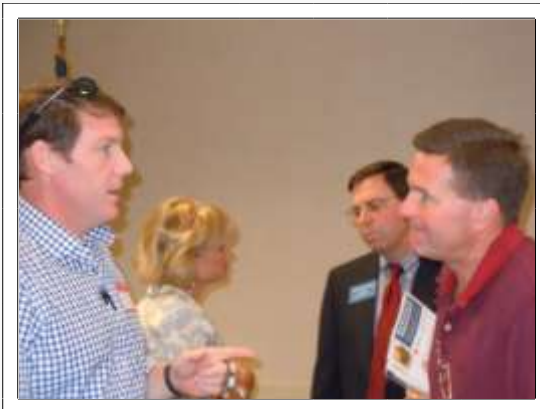
Networking at the Monthly Meeting