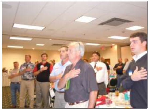
Pledge of Allegiance