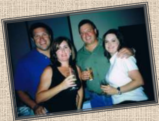
From the Past